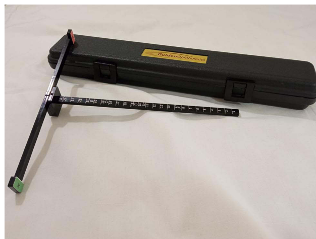
Figure 1 OculoMotor Assessment Tool (OMAT).

This T-shaped tool is non-invasive and can be used chair-side. The OMAT (Figure 1) has two 25-cm long bars, attached to form a T-shape with magnets that can be rotated and locked. The OMAT is comprised of high-contrast white-on-black targets, as well as red and green "X" targets.