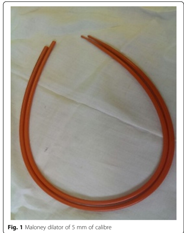
Fig. 1 Maloney dilator of 5 mm of calibre

Caustic ingestion for suicidal purpose is not an uncommon event in Western Countries. The overall prevalence of esophageal stenosis is 129 and 122 per 100.000, for men and woman respectively [7]. Endoscopy within the