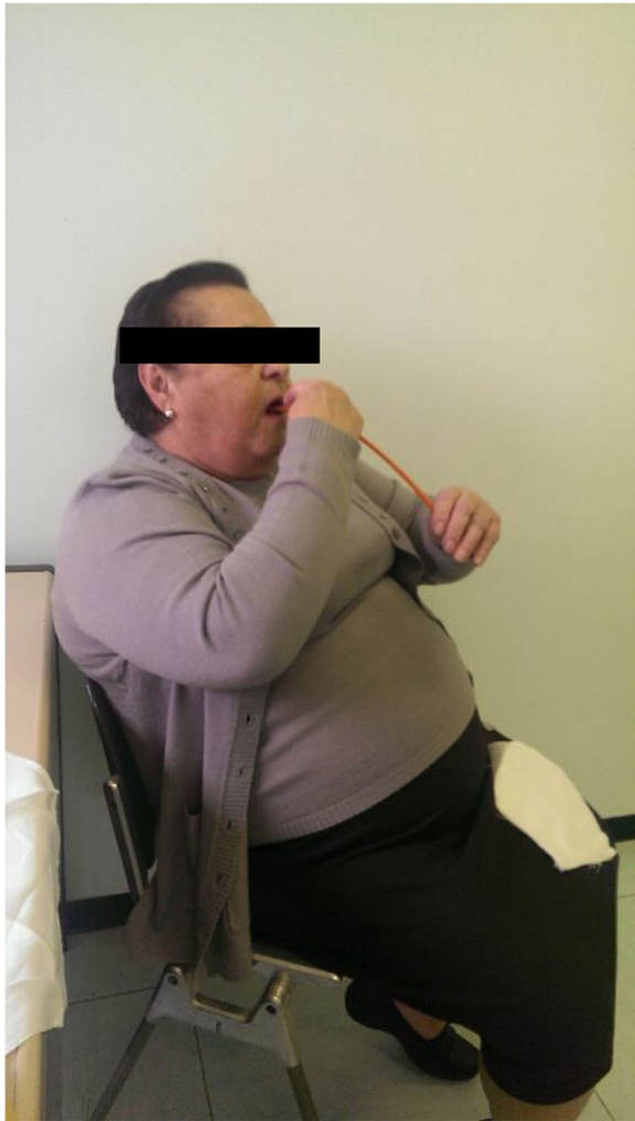
Fig. 2 The patient during the self-dilation procedure