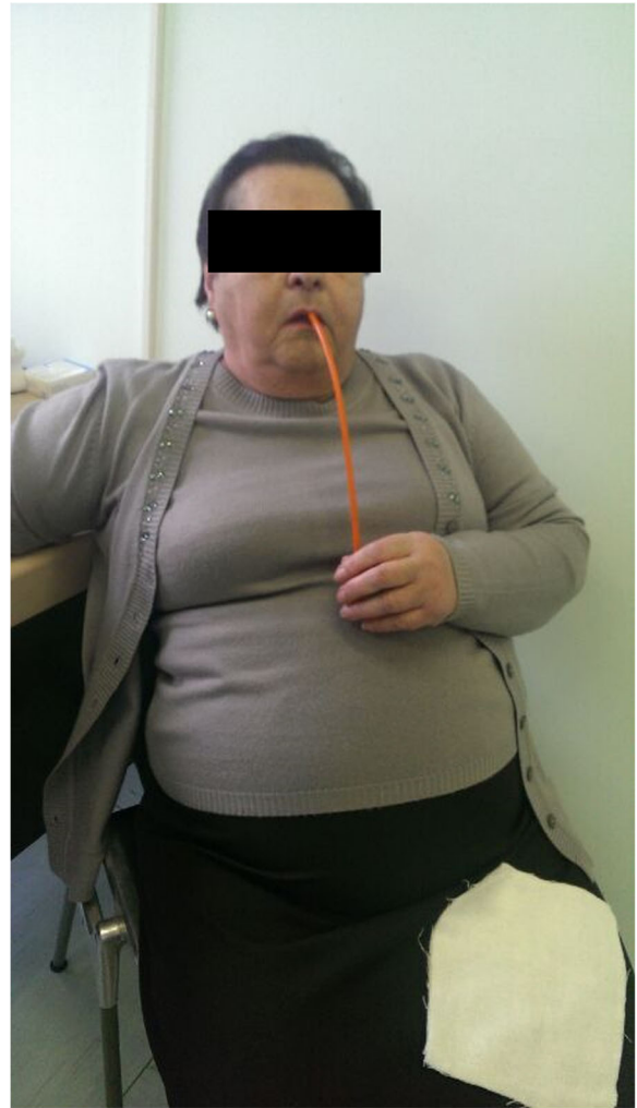
Fig. 3 The patient during the self-dilation procedure