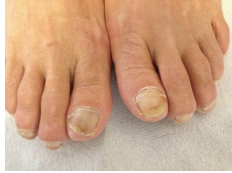
FIGURE 1: Discoloration and onycholysis image in bilateral toenail.

The tested pathogen was indicated as Rhodotorula glutinis/mucilaginosa according to the Vitek automated identification system (bioMérieux, France) using Yeast Biochemical Card 2 (YCB). The species identification of the strains was performed at the Public Health Institution of Turkey-Mycology Reference Laboratory (PHIT-MRL). The pinkish-orange color, mucoid-appearing yeast colonies on SDA at 25°C, the morphological evaluation in the Corn Meal-Tween 80 agar, observed oval/round budding yeast at 25°C for 72