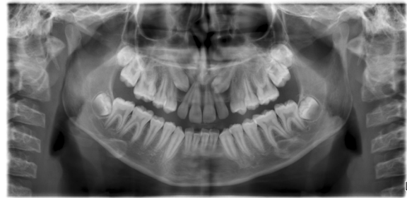
Figure 1 Panoramic image showing bilateral impacted canine in a female patient.

There were five right and seven left impacted maxillary canines, while there were two right and two left mandibular impacted canine teeth. Of all patients, two impacted canines were bilateral (Figure 1), whereas 14 were unilaterally impacted teeth (Figure 2). No significant difference