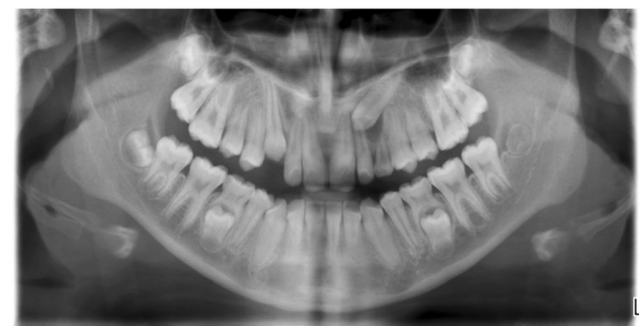
Figure 2 Panoramic image showing unilateral impacted canine in maxilla of a male patient.

Knowledge of dental anomalies in patients is fundamental for treatment planning [28]. Different prevalence was reported among different ethnic groups [2]. Ethnic background of the sample may result in higher or lower rates of some anomalies [4]. Traits that may occur more commonly in certain ethnic groups may be considered specific to that population [3]. According to Stecker et al. [1], dental practitioners who are aware of ethnic differences in the occurrence of dental anomalies will be more