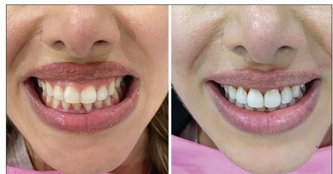
Figure 4: Preoperative and postoperative gummy smile for Botox treatment (Group B)