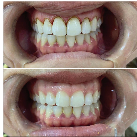
Figure 2: Intraoperative photographs showing the appearance of the gingival segment of the laser gingivectomy (Group A)