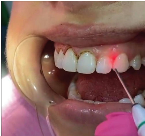
Figure 1: Intraoperative photograph demonstrating Dr. Smile diode laser gingivectomy

This study included 24 female patients suffering from GS and was divided randomly into two groups. Group A (DDLG) showed immediate effects, while results emerged after 1 week