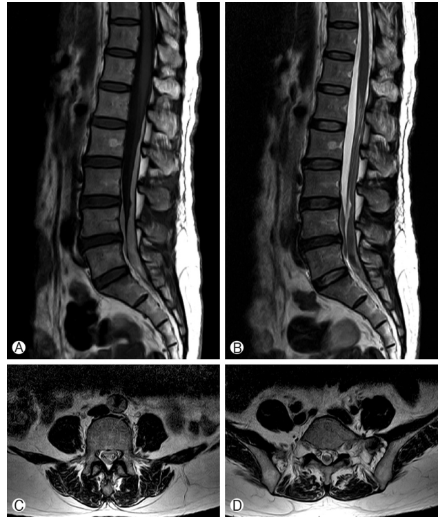
Fig. 3. MRI showing a longitudinal space occupying lesion extending from T12 to S2 in the spinal canal. (A) A sagittal T1-weighted image showing, the homogenous lesion with a slightly higher signal intensity relative to the spinal cord. (A) The lesion shows a homogenous signal that is isointense with the spinal cord on a T2-weighted sagittal image. (B) An axial T2-weighted image showing, the hematoma has crossed the midline. (C), (D).

Factors that trigger or contribute to the development of spinal hematoma that have been reported are a trauma, coa-