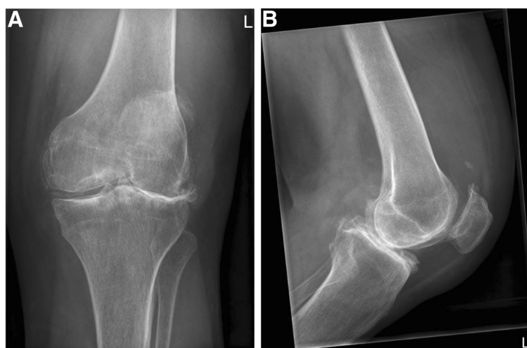
Figure 1 An X-ray of the left knee showed severe osteoarthritis with evident lateral joint space narrowing, bone sclerosis, osteophytes and a calcified medial meniscus. A. anteroposterior axis. B. lateral axis.

The diagnosis in this case report was based on synovial tissue analysis. This coincidental finding was reported twice before, though this was in elbow and shoulder surgery [2,7]. In a literature overview till 2006, 13 cases of intra-articular synovial manifestation of NHL were presented, of which 11 cases concerned the knee [2]. All patients presented with inflammation of the knee joint, sometimes clinically simulating RA [1,2]. In later literature two more patients were strikingly described discovering NHL with arthroscopy [3,8]. Both patients were planned for a partial meniscectomy. One patient (51 years old) had a history of gonarthrosis deformans, without signs of inflammation of the knee. [8] The other patient (31 years old) had a constant knee pain and swelling [3]. Arthroscopically obtained atypical synovial tissue appeared to be a B-cell lymphoma in both cases.