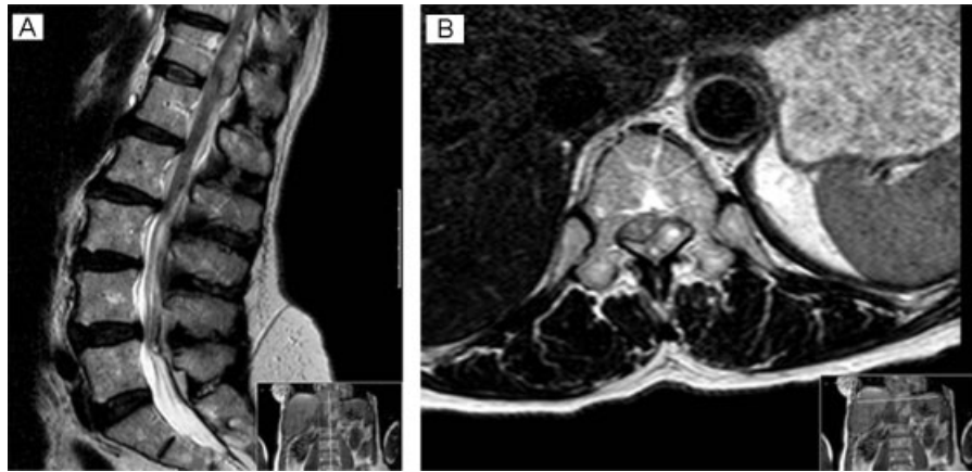
Fig. 1 (A, B) Sagittal and axial magnetic resonance image of the thoracolumbar spine showing an extra axial space-occupying lesion compressing the cord at the level of T12. This appears to be occupying epidural space and is posterior and to the left of the theca. There is high signal within the adjacent cord consistent with a compressive myelopathy.

extra axial lesion compressing the cord at the level of T12 that was low signal on T1 and high signal on T2. It appeared to be occupying epidural space posterior and to the left of the theca. The appearances suggested an acute epidural hematoma.