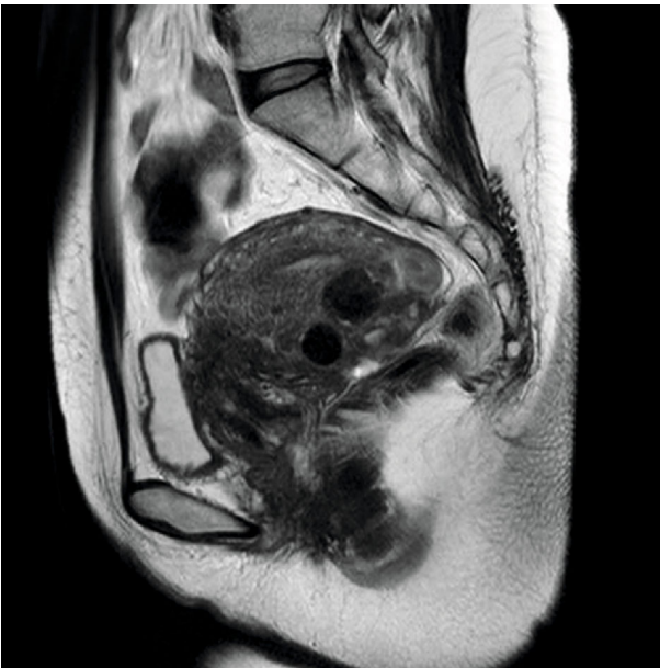
FIGURE 2: Magnetic resonance imaging was performed 2 years after uterine artery embolization. The leiomyomas grew smaller.

had actually sarcoma from the beginning or developed sarcoma during treatment for leiomyomas. Because sarcoma was suspected, she was referred to a higher-order medical institution. She underwent total abdominal hysterectomy with bilateral oophorectomy, pelvic lymphadenectomy, and omentectomy. The uterus measured 14 × 19 cm. There was a pedunculated neonatal head-sized tumor at the uterine bottom and multiple egg-sized leiomyomas in the uterine body.