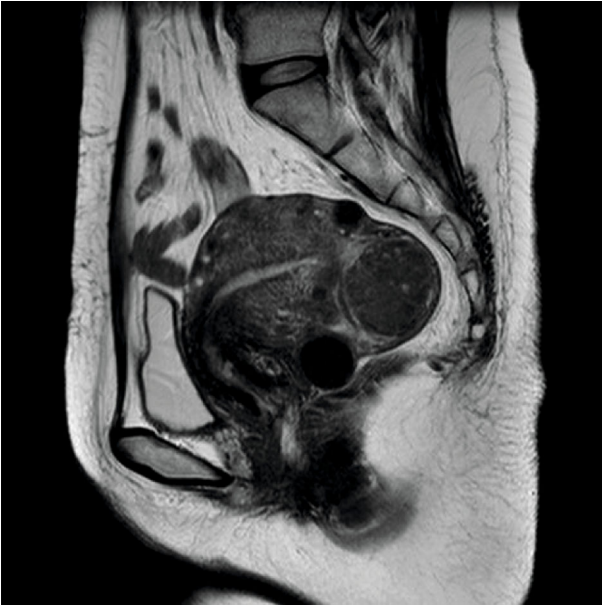
FIGURE 1: Magnetic resonance imaging was performed before uterine artery embolization. MR images show clearly visible fibroids and not tumors.