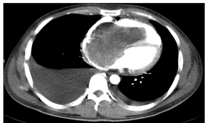
Figure 2: Computerized tomography with contrast shows a single and large contrast non enhancing intra cardiac mass occupying right atrium and right ventricle with right ventricular outflow tract and inferior venacava extension. This typical description is consistent with intra cardiac thrombus