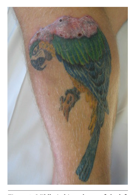
Figure 1. Mildly itching plaque of the left leg.

©Copyright G. Pasolini et al., 2011 Licensee PAGEPress, Italy Dermatology Reports 2011; 3:e47 doi:10.4081/dr.2011.e47