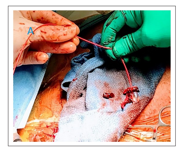
Figure 2. Intra-operative picture showing thrombus retrieved from the axillary graft.