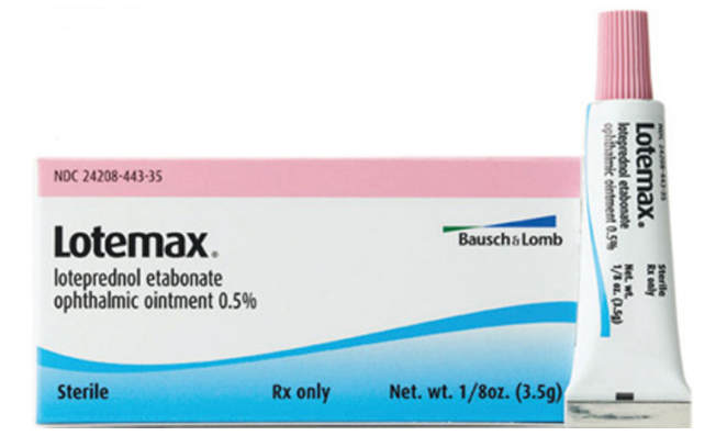
Figure I Loteprednol etabonate 0.5% ointment, Bausch and Lomb Incorporated, Rochester, NY, USA.