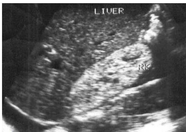
Figure 2 HIV nephropathy in a 34-year-old man. Longitudinal sonogram demonstrates normal sized right kidney with increased cortical echogenicity. Diffuse increased cortical echogenicity is associated with a poor prognosis.