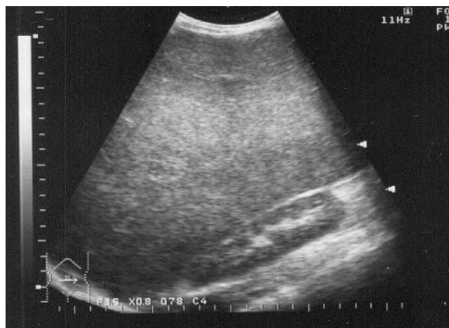
Figure 1 Longitudinal sonogram of liver showing hepatomegaly and increased parenchymal echogenicity with posterior shadowing (*) compatible with fatty infiltration.

Gall bladder wall thickening was not associated with the presence of calculi. Acalculous cholecystitis was also not recorded. Extrahepatic dilatation was found in 10(2.6%) patients; this finding has been reported as a sequel of AIDS Related Sclerosing Cholangitis (ARSC) [4]. However, such patients had associated findings of gall bladder wall thickening which were not demonstrated in our cases. Since these patients had no symptoms referable to the biliary system, no further diagnostic procedures were