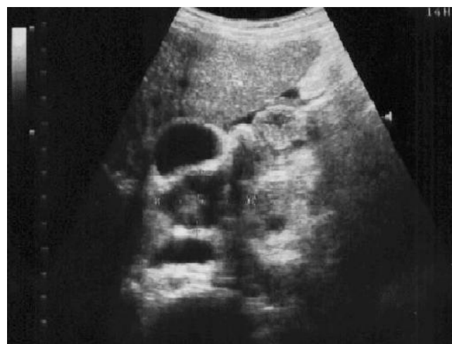
Figure 4 Longitudinal sonogram of liver showing a large retroperitoneal lymph node adjacent to the gall bladder in a 27 year-old asymptomatic HIV+ patient.