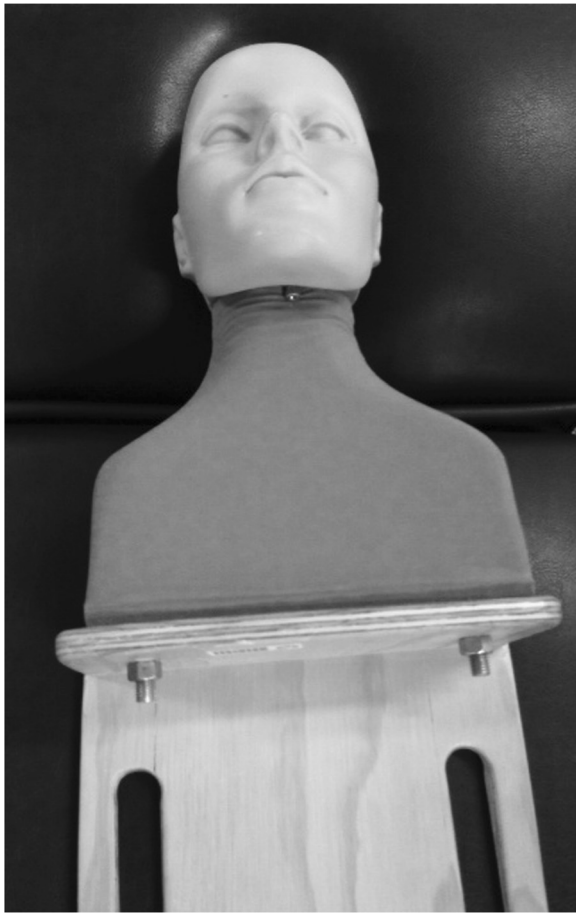
Fig. 1 The mannequin

three, two hour weekly training sessions in the performance of a commonly used cervical spine manipulation technique referred to as the index pillar push [21]. During the weekly training sessions and to ensure that the assessor remained blinded to group allocation students were supervised by academics not involved in the assessment of the students. The supervising academics provided each student with regular personalised feedback relating to their performance of the required technique during the weekly training sessions. After the third weekly training session, all members of each group crossed over and undertook three additional training sessions using the alternate method. The flow of the study is displayed in Fig. 3.