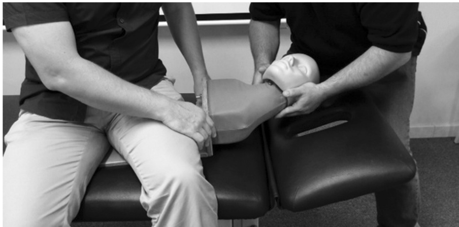
Fig. 2 Technique demonstration on the mannequin

The maximum total score on the validated questionnaire is 100 %. In order to pass the assessment a student must achieve a minimum score of 69 % overall.