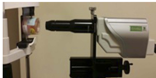
Figure 1 Imaging of a donor cornea through a sealed and sterile case. Abbreviation: HD-OCT, high definition optical coherence tomography.

Statistical analyses were performed using SPSS software version 22.0 (SPSS, Chicago, IL, USA). Means of vari-