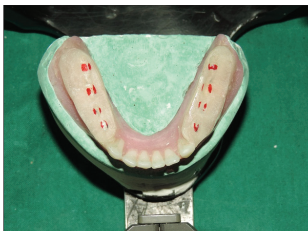
Figure 4: Indentation marks on flat occlusal table of mandibular denture.