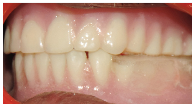
Figure 5: Maxillary palatal cusps contacting the occlusal table.