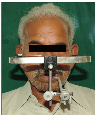
Figure 3: Facebow transfer.

The poor neuromuscular control is considered to be the main reason for the poor voluntary movements of the mandible. Edentulous patients are unable to perform satisfactory mandibular functional movements as they receive very limited