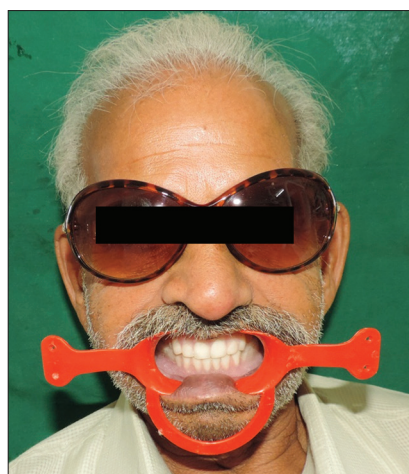
Figure 6: Post-treatment view: Insertion of definitive complete dentures.