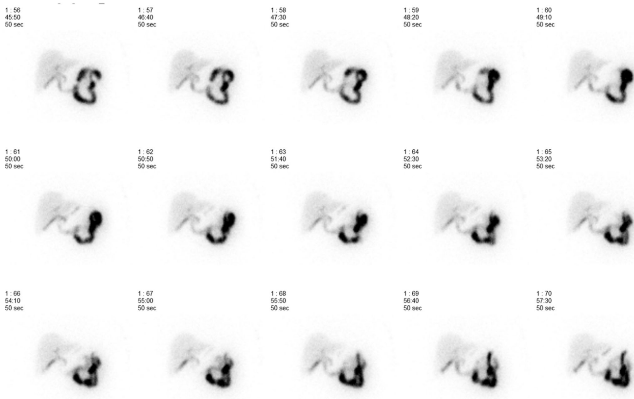
Fig. 1 Dynamic gamma camera images of bile reflux scintigraphy. Images of a representative patient show bile tracer in the gastric pouch beginning at 51 min after intravenous administration of bile tracer ( ^{99m}\text{Tc} -mebrofenin)

variables with BRS and UGE findings were analyzed with the binary logistic regression and one-sample T test, respectively. P value less than 0.05 was considered statistically significant.