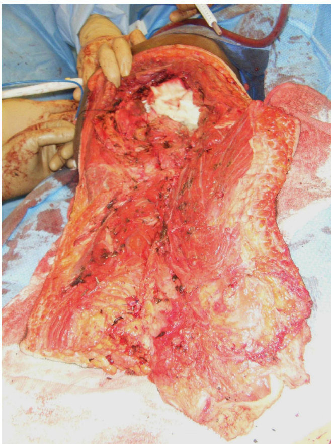
Figure 2 A large medial myocutaneous flap is created.

off of the femur using a periosteal elevator. After control of the popliteal vessels, a large medial myocutaneous flap was created (figure 2). Exact muscles included, as well as the shape of the flap, are dependent on what tissue is viable, but we typically include the hip adductors. The femoral artery, nerve and vein are not dissected and are avoided. Preservation of the neurovascular bundle allows for a large perfused flap. An NPWT device is placed for temporary wound coverage. After the index operation, all patients were admitted to the burn or trauma intensive care units for ongoing critical care support. NPWT is used for 2 to 3 weeks until output is <100 cc/day and the flap is no longer