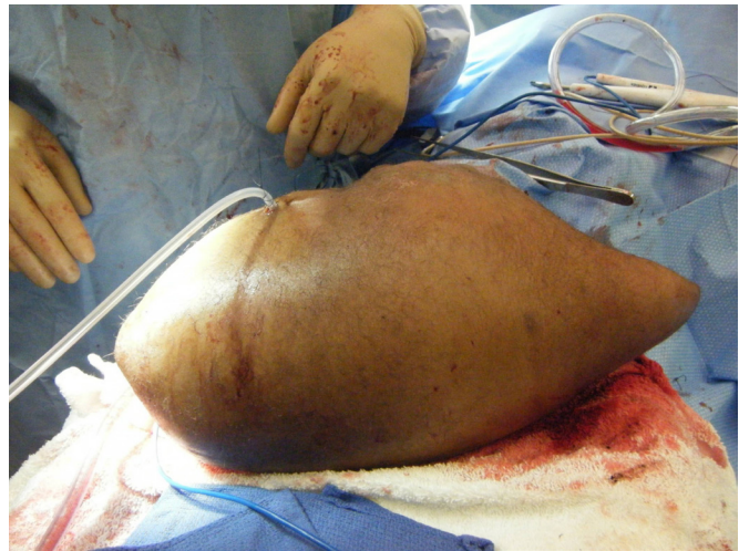
Figure 3 The flap is closed to cover the defect, with drains to prevent a seroma.

edematous. The flap is then folded on itself to cover the defect, with drains to prevent seroma (figure 3).