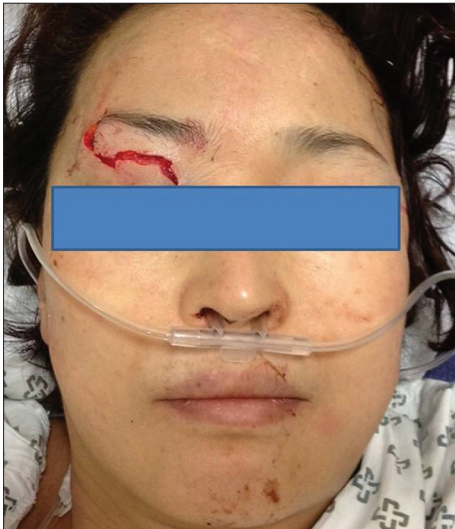
Fig. 2. Patient's face at the time of admission reveals a laceration of the right upper eyelid.