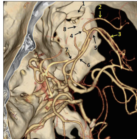
Fig. 4. Computed tomography-angiography shows fracture of the right orbital roof and a traumatic aneurysm of the callosomarginal artery-cortical artery junction [1 : right orbital fracture, 2 : right callosomarginal artery, 3 : right pericallosal artery (A4), 4 : traumatic aneurysm, 5 : right long callosal artery, 6 : right pericallosal artery (A2), 7 : left pericallosal artery (A2), 8 : cortical artery].

trajectory crossed the midline and there was subarachnoid hemorrhage, a CT-angiographic examination was performed eight hours later from accident. A TICA at the right CM-CA junction was identified (Fig. 4). We made a bicoronal incision and performed an interhemispheric approach two days later.