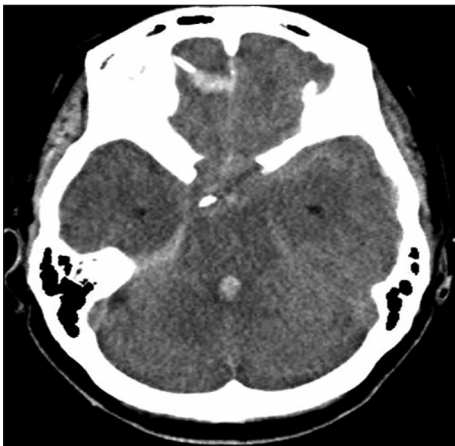
Fig. 3. Computed tomography in the emergency department shows subarachnoid hemorrhage, frontal lobe hemorrhage, and intraventricular hemorrhage.

trajectory crossed the midline and there was subarachnoid hemorrhage, a CT-angiographic examination was performed eight hours later from accident. A TICA at the right CM-CA junction was identified (Fig. 4). We made a bicoronal incision and performed an interhemispheric approach two days later.