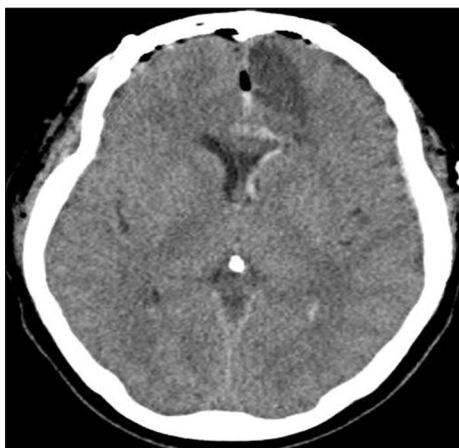
Fig. 6. Postoperative computed tomography reveals a small infarction in the left frontal lobe.