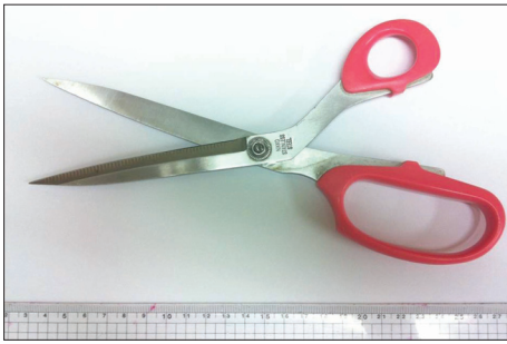
Fig. 1. Scissors after their removal by another person at the accident site.