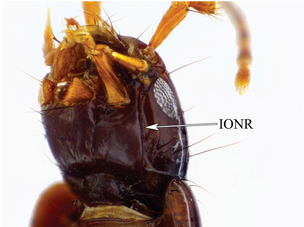
Figure 5. Lateroventral view of head of Quediopsis howensis Jenkins Shaw & Solodovnikov, sp. n. IONR = Infraorbital extension of nuchal ridge.

HOWE ISLAND, Goat House Track, 11 Nov 1979, G.B. Monteith / Q.M. BERLESATE No. 138, Volcanic Soil, 250m, Pickard VegL Hb, Sieved litter'; 1 female, 'LORD HOWE ISLAND, Mt Gower summit (NE), 9 Nov 1979, G.B. Monteith / Q.M. BERLESATE No. 134, Volcanic Soil, 850m, Pickard Veg: GMF, Sieved litter'; 1 female, 'LORD HOWE ISLAND, Erskine Valley, north side, 22 Nov 1979, G.B. Monteith / Q.M. BERLESATE No. 160, Volcanic soil, 150m, Pickard Veg:CfLq, Sieved litter / VOUCHER SPECIMEN 81-40' (QM).