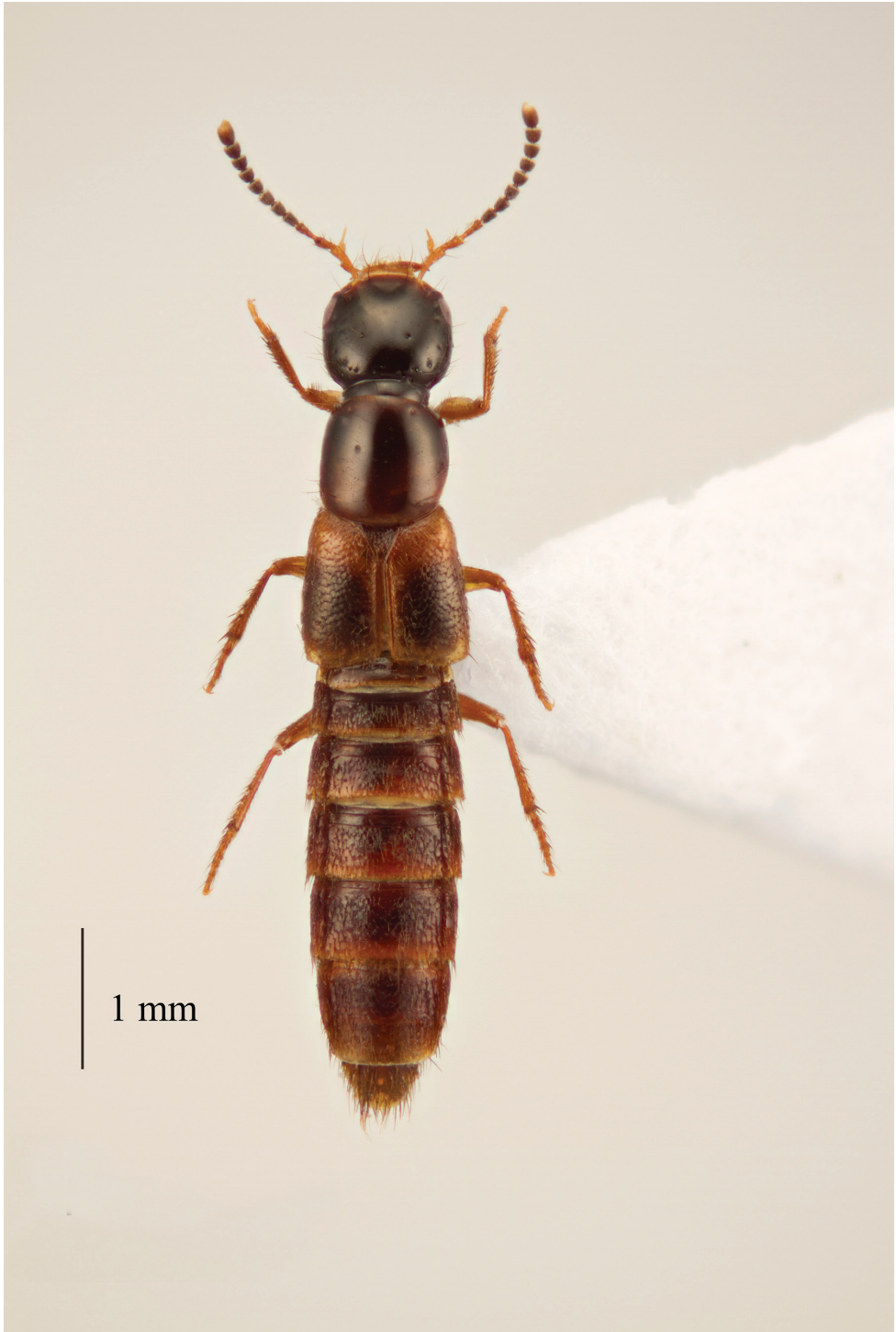
Figure 1. Habitus of Cheilocolpus kentiae (Lea, 1925).