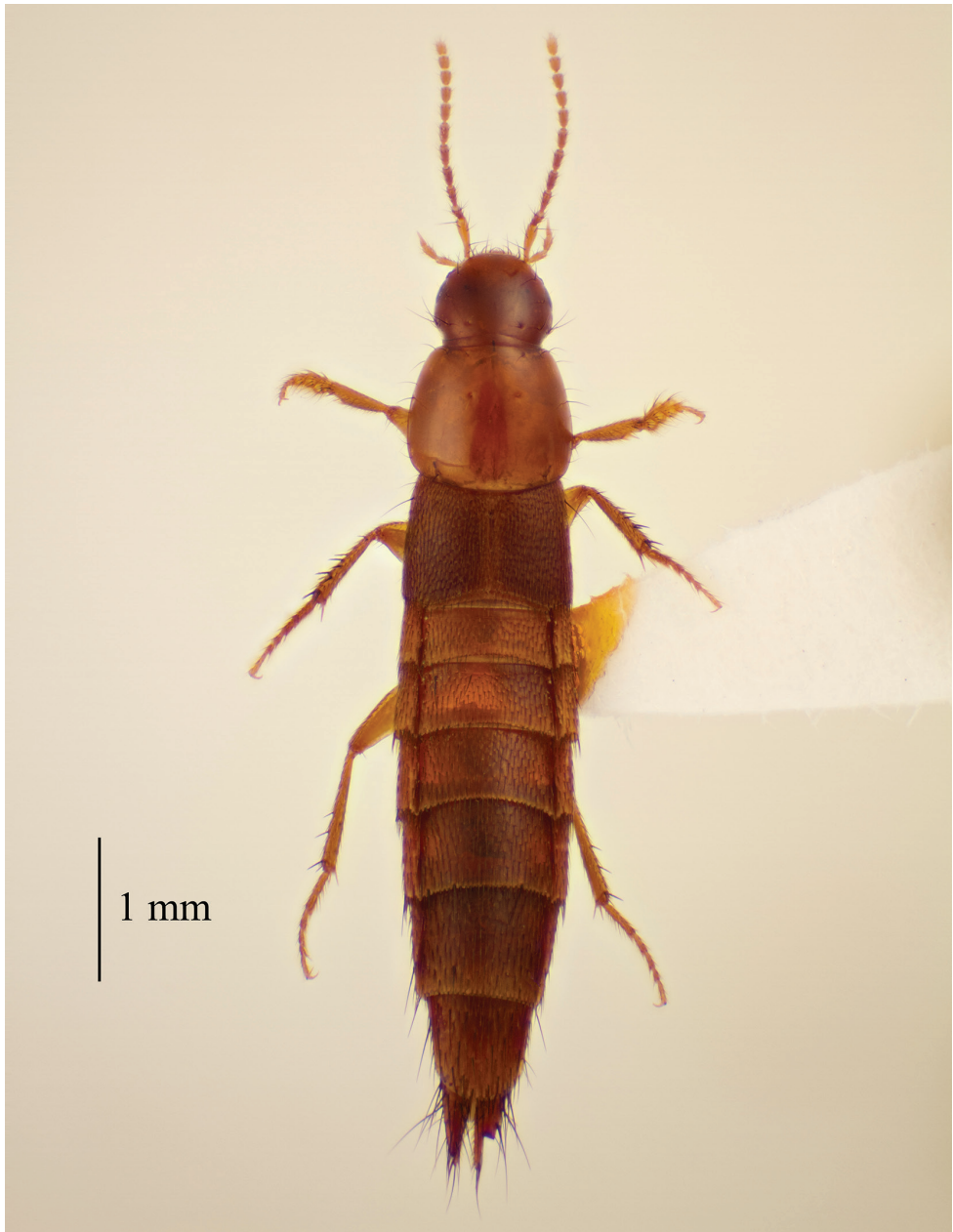
Figure 4. Habitus of Quediopsis howensis Jenkins Shaw & Solodovnikov, sp. n.

Howe Island, 17–31.v.1980, S. + J. Peck / Stevens Reserve, 10', 24.v.80, moist litter in limestone sink, 16 L Ber'; 1 male, 'AUSTRALIA: N.S.W. Lord Howe Island, 17-31.v.1980, S. + J. Peck / Intermediate Hill, 300', 18.v.1980, rotted bark w/fungi, tall forest, Ber 19 L / Quediopsis sp det. A.F. Newton 1987' (ANIC); 1 male, 'LORD