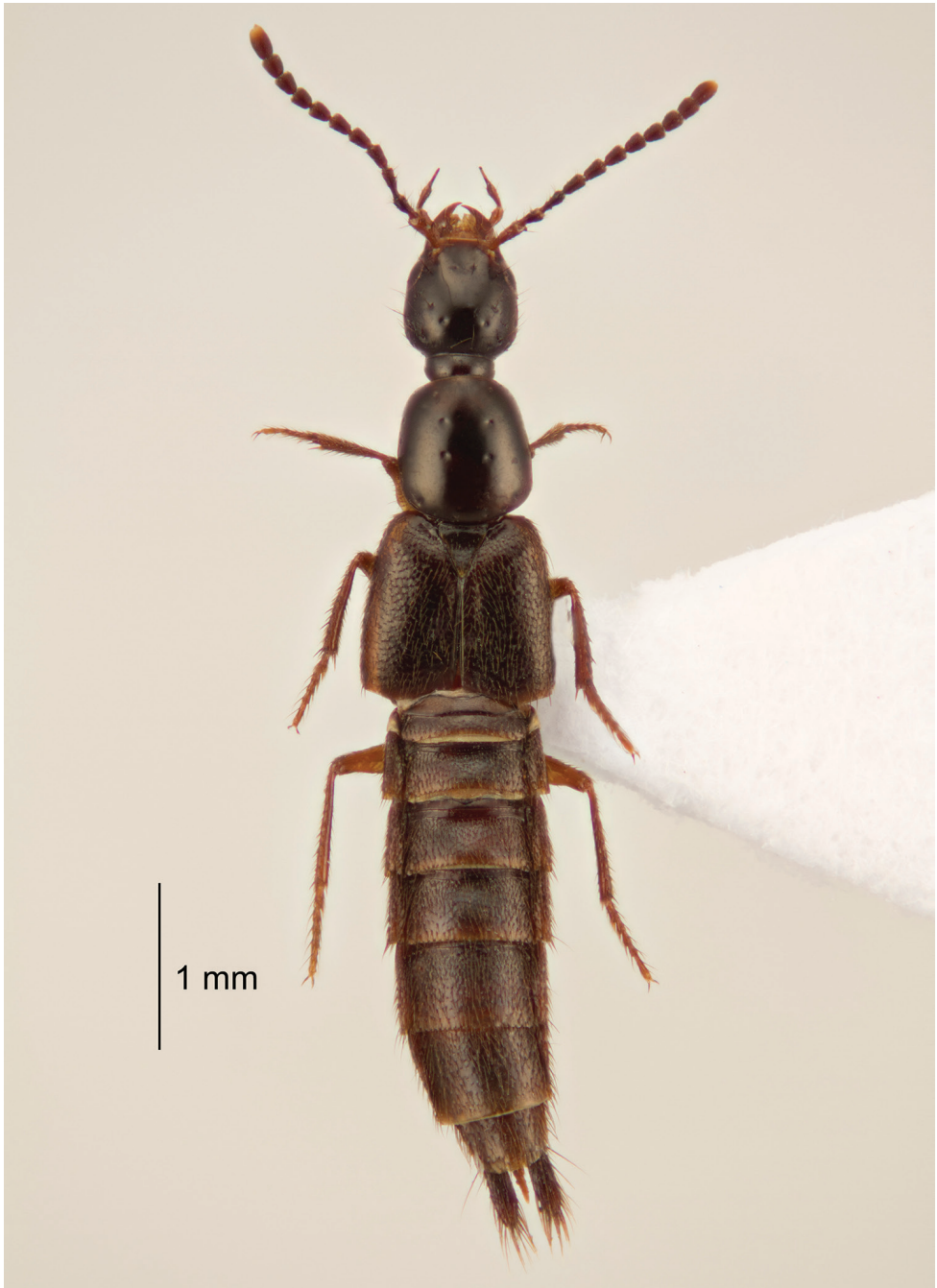
Figure 3. Habitus of Cheilocolpus olliffi Jenkins Shaw & Solodovnikov, sp. n.