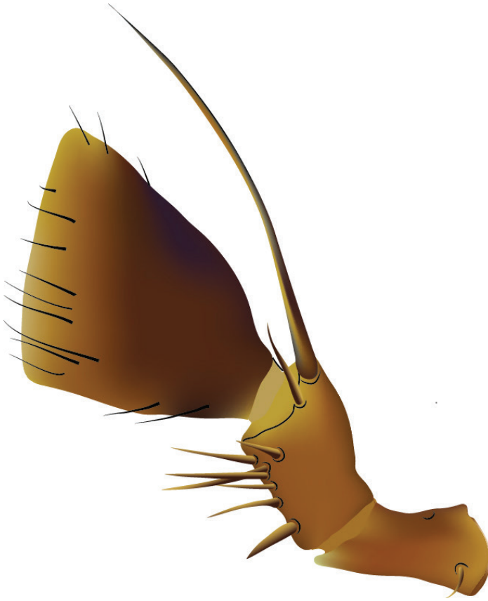
Figure 6. Labial palpi of Quediopsis howensis Jenkins Shaw & Solodovnikov, sp. n.

Antennomeres elongate, all of same colour. First antennomere slightly expanded apically, about as long as second and third combined.