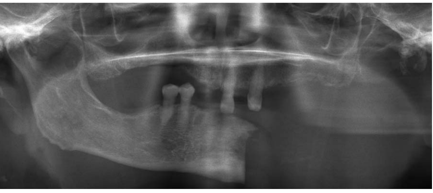
Figure 2. Follow-up orthopantomography 2 weeks after hemimandibulectomy.

Nine texts were extracted by the literature search. Twenty four patients (15 males and 9 females) were included in this review (Table 1). [3,5–12] The youngest was 6 years' old, and the oldest was 51 years' old, and their mean age and standard deviation was 21.6\pm12.9 years. [3,5–12] The most common disease associated with surgical procedures was ameloblastoma (12 patients). [3,5–12] There is no case of MRONJ in those reports. There were some cases performed immediate reconstruction, and some cases preserved the periosteum.