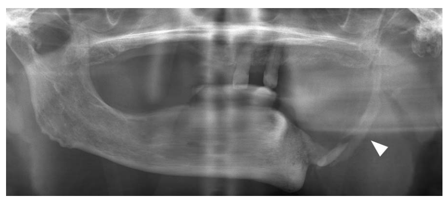
Figure 3. Follow-up orthopantomography 2 years after hemimandibulectomy revealed partial spontaneous regeneration of the left mandible (white arrow).