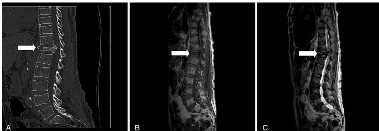
Figure 1. (A) CT scan of a compression fracture of T12 with an incomplete vertebral body wall and protrusion of a bone fragment into the spinal canal before operation. (B and C) On sagittal MRI, the T12 fracture with epidural involvement exhibited low signal intensity on T1-weighted images and high intensity on T2-weighted images. CT=computed tomography, MRI=magnetic resonance imaging.

Titanium mesh bone grafting combined with pedicle screw internal fixation can restore the vertebral height, partially reduce bone fragments, decompress neural elements, correct the angular deformity and stabilize the spinal column. This approach