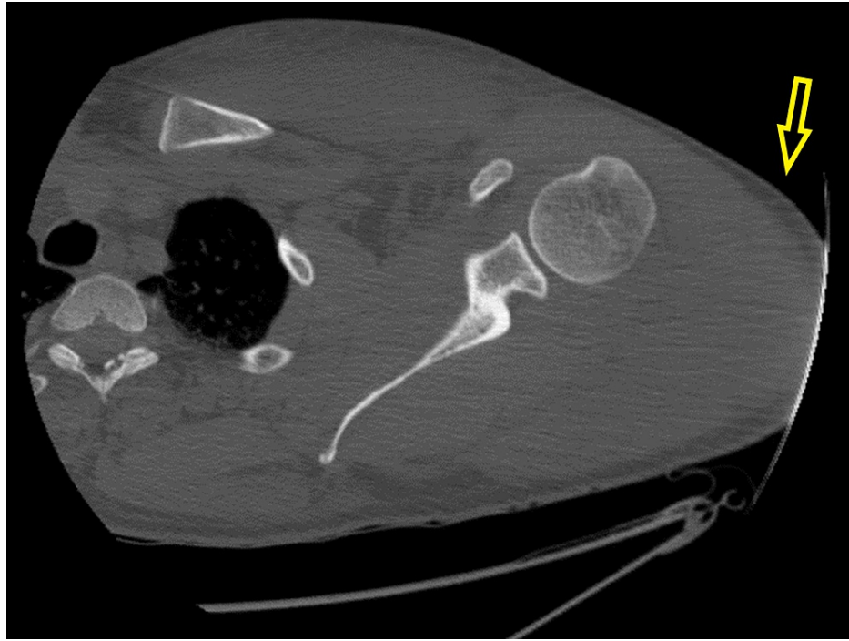
FIGURE 2: CT scan of the left upper extremity showing diffuse edema (yellow arrow) within the left shoulder compartment.