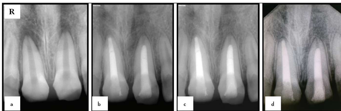
Figure 1. (a) Preoperative intraoral periapical radiograph of teeth #11 and #21 with non-blunderbuss canal and open apex associated PAI scores of 5 and 4 respectively. (b) Immediate postoperative intraoral periapical radiograph of tooth #21 showing MTA apical barrier 2 mm short and tooth #11 showing MTA apical barrier up to radiographic root end. (c) & (d) Follow up intraoral periapical radiograph exhibiting resolution of the periapical lesion at 12 and 24 months

No case was lost to follow up at the end of the observation period of twenty-four months. All patients reported no symptoms associated to the teeth in question, suggesting that the treatment was successful. In this study, the PAI score was considered as an ordinal scale. They were dichotomized as healed, PAI scores < 3 or non-healed, PAI scores \geq 3 . On inter-group comparison between the frequency distribution of baseline