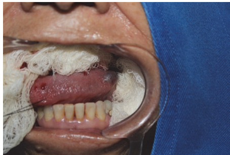
FIGURE 4: Tongue pulled to the right and adjacent tissues protected by gauze with Vaseline.