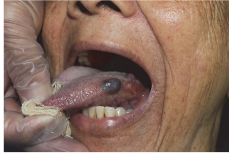
FIGURE 1: Hemangiomatous lesion on the left lateral border of the tongue.