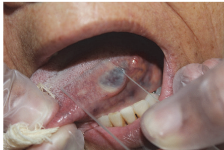
FIGURE 2: Diascopy (pressure on the lesion with a glass slide) showing color change.

ensure the safety margin without causing major defects, since it destroys deep diseased tissue through in situ freezing [11].