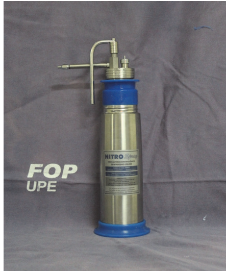
FIGURE 3: Cryocautery system: liquid nitrogen container and pump system used in the present case.