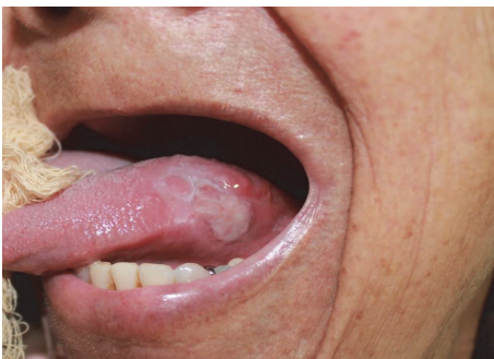
FIGURE 9: Postoperative week 6.