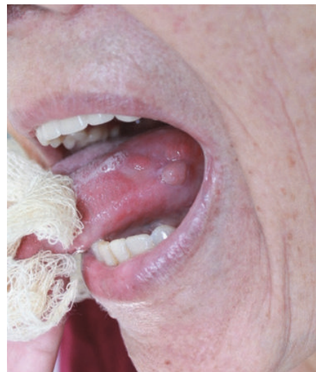
FIGURE 10: Postoperative week 8.