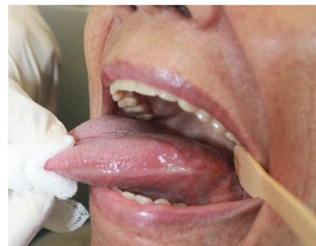
FIGURE 11: Postoperative month 18.

Hausamen [12], for 3 years, successfully treated several diseases of the oral cavity, including hemangioma, leukoplakia, and squamous cell carcinoma. In agreement with the results obtained and reported in the literature [2, 13–15], in