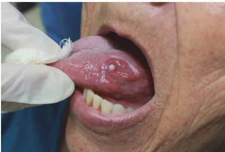
FIGURE 8: Postoperative week 3.