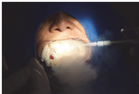
FIGURE 5: Application of liquid nitrogen on the lesion.

first postoperative days, the patient complained of mild pain, which was managed with dipyrone (500 mg) every 6 hours for 5 days. There were no signs of infection during the healing period.