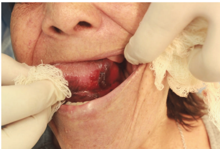
FIGURE 7: Postoperative week 1.