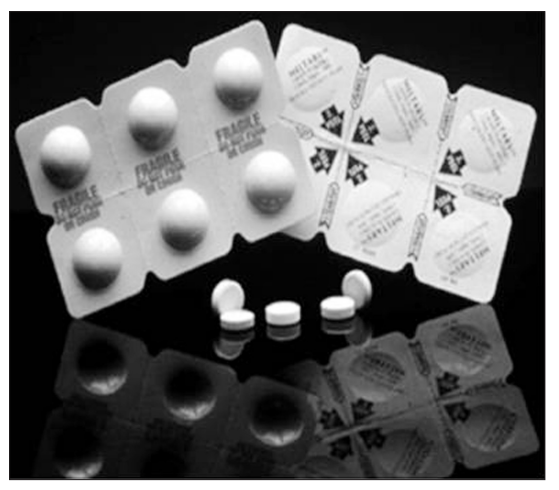
Figure 2: Typical OraSolv<sup>®</sup> package.<sup>[52]</sup>

Wowtab is a patented technology developed in Japan. This technique has been used in the production of Benadryl Fast melt tablets. In this technology, two different types of saccharides are combined to obtain a tablet formulation with adequate hardness and fast dissolution rate.<sup>[54]</sup> Due to its significant hardness, the WOWTAB formulation is more stable to the environmental conditions than the Zydis or Orasolv and is suitable for both conventional bottle and blister packaging. The taste-masking technology utilized in the WOWTAB is proprietary and claims to offer superior