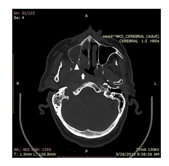
Figure 2. Computer tomography (CT) scan showing nasopharyngeal tumor mass infiltrating the maxillary sinus, right nasal fossa and the right ptery-goidian fossa.

measures improved the patient's overall state by stopping the hemorrhage, but they did not relieve the hemicrania. The otomicroscopic examination revealed a perforated tympanic membrane with granulations which were further excised. The previous treatment was continued.