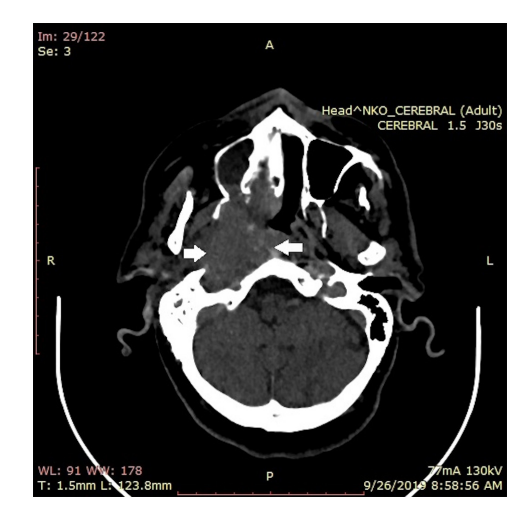
Figure 1. Computer tomography (CT) scan showing right nasopharyngeal solid tumor mass with local invasion.

In September 2019, the initial clinical diagnosis was haemorrhagic otitis media, for which the patient received a treatment course with antibiotics, antialgics, sedatives, anti-hypertensives (including \beta -blockers, which can have various immunologic or non-immunologic side effects) (9) and specific local treatment with aspiration, instillations and local hygienic measures. The patient was advised to avoid aggressive endauricular maneuvers and to avoid wearing the hearing prosthesis. The medical