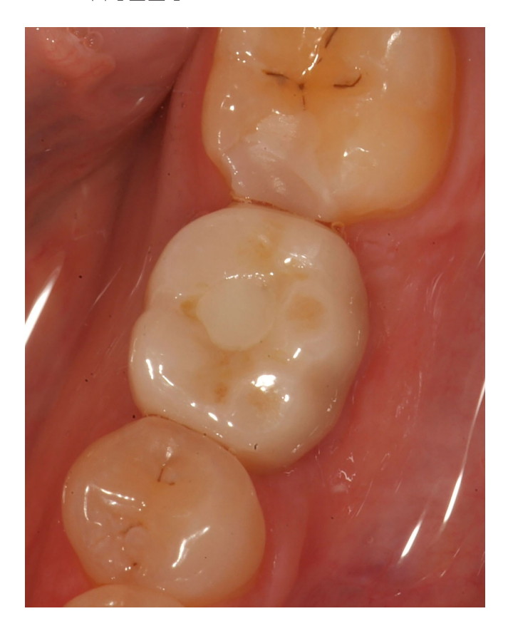
FIGURE 1 Full-contour zirconia screw-retained restoration at position 36

was performed under local anesthesia. A parallel-walled implant with a TiUnite surface and conical connection (NobelParallel CC, Nobel Biocare AB, Goteborg, Sweden) was placed, according to the manufacturers' protocol. Implant diameter was 4.3 mm and length varied from 8.5 to 13 mm, dependent on available bone height at the implant site. A cover screw (Nobel Biocare AB) was placed, and the wound was closed. One week after implant placement, a follow-up visit was scheduled for suture removal and review of the healing process. After 3 months, the implant was uncovered and a healing abutment (Healing Abutment CC RP, Nobel Biocare AB) was installed.