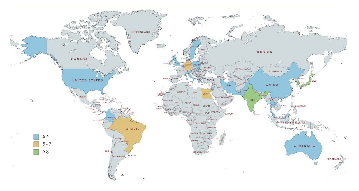
Figure 2. Publications by country. The grey color indicates that no studies are provided for the scoping review. Created with mapchart.net.

Of all articles (n = 103) that met the selection criteria, 64.1% were observational studies (n = 66) [3,5,11-24,26-35,39-42,44,46,48,50-57,59,61,63,65,67-70,75-77,81,90-96,104-107,110,111] (Table S1, Supplementary Material). When the data were grouped according to the type of studies by their year of publication, observational studies were predominant during 2010–2015 (46.7%, n = 48; p < 0.01), whereas interventional studies became predominant during 2016–2020 (23.3%, n = 24; p < 0.01) (Table 1).