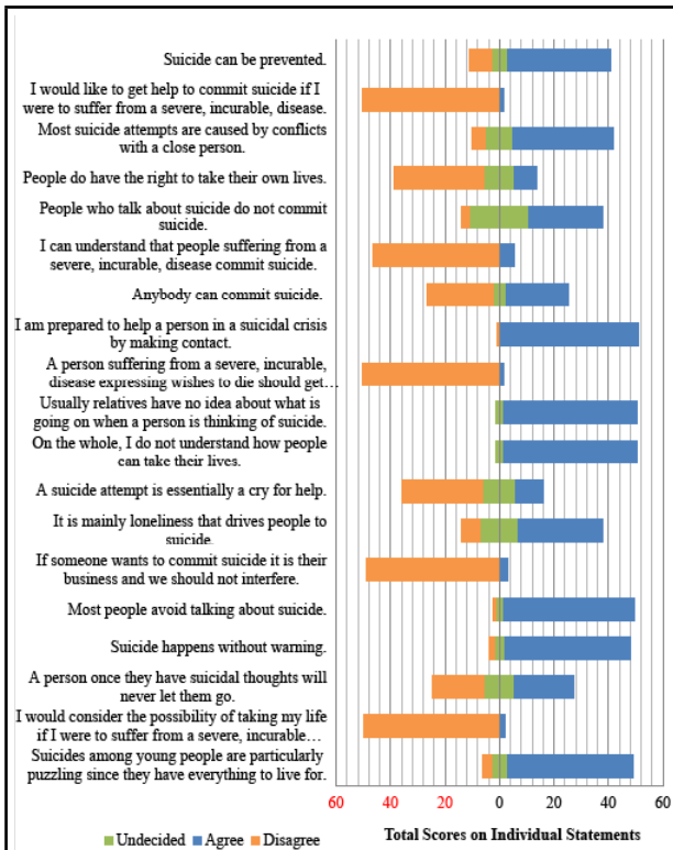
Figure 2. Attitude towards Suicide (ATTS) Score on individual statements (19-37).

Results of in-depth interview: The following were the major theme identified from the in-depth interview (Table 2).