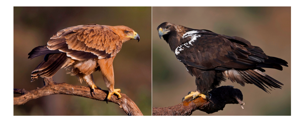
Figure 1. Spanish Imperial Eagles Aquila adalberti . On the left, a juvenile individual showing a light-colored plumage mainly based on the presence of pheomelanin. On the right, an individual showing the much darker full adult plumage (with white "shoulders"), based on eumelanin. This eagle species presents delayed plumage maturation, and the adult plumage is typically attained when individuals are 4 years old.

The Spanish Imperial Eagle Aquila adalberti sports a full light-orange plumage coloration in juveniles whereas the adult birds are almost fully black (Figure 1). The same intraspecific variation can be found in mammals, for instance with the black-and-gold howler monkey Alouatta caraya . The adult male is pitch black, whereas adult females and juveniles are gold-colored. Were the single and only Psittacosaurus studied in [9], and the one Borealopelta specimen studied in [10], members of a monochromatic, dichromatic, or polychromatic species? With a sample size equal to one, this is impossible to assert. Curiously enough, Psittacosaurus is one of the few dinosaur genera for which a lifetime growth curve has been built based on fossil bone structures, and it has been proposed that they grew for several years before reaching the larger size [43]. For this curve to be generated, numerous specimens from the same paleontological site were used. Ideally, and following this example, paleoscientists should aim to describe integumentary coloration in a set of different individuals of different age classes and the two sexes, to determine whether the species under investigation showed intraspecific color variation.