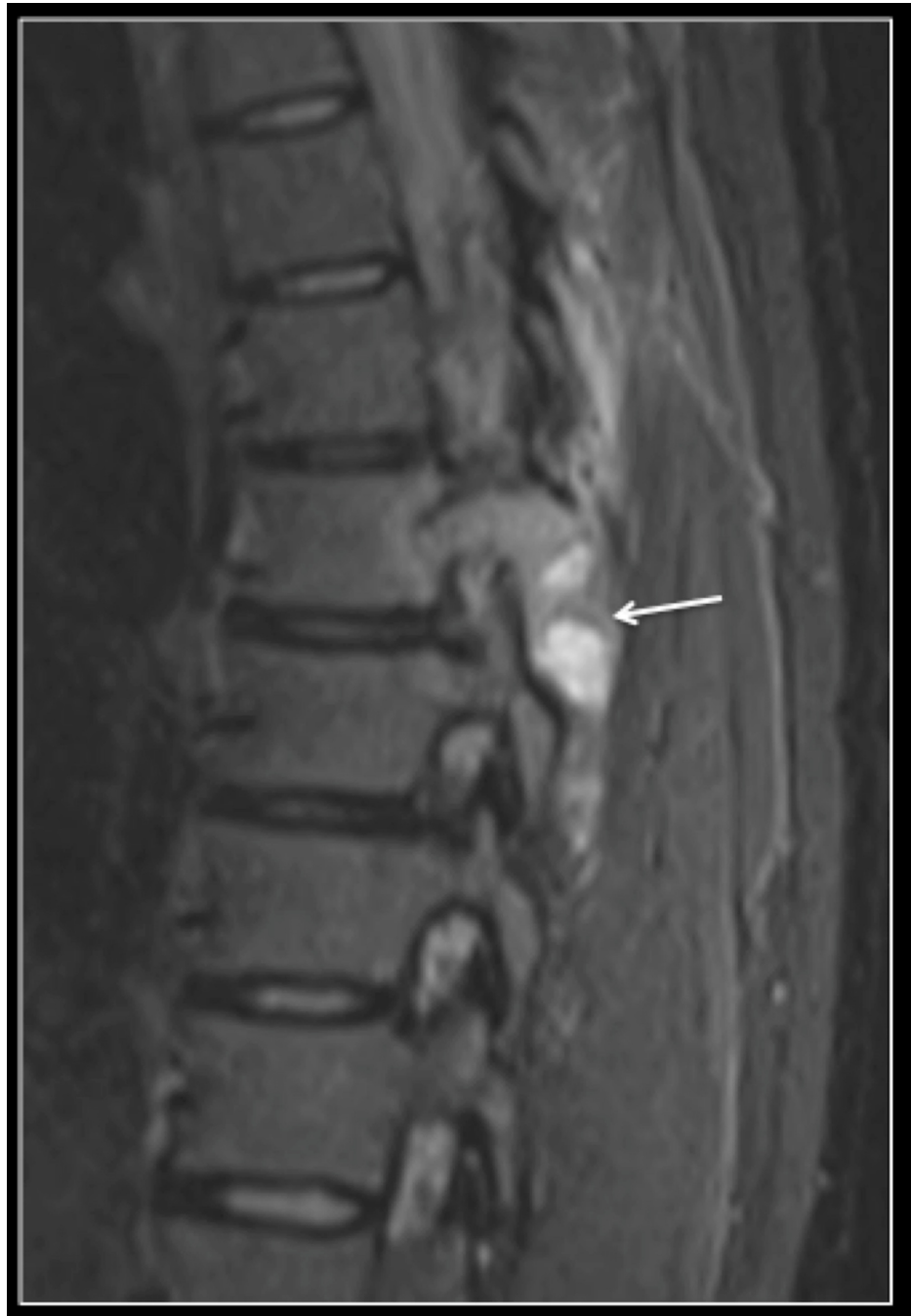
FIGURE 1: Sagittal STIR MRI of the thoracic spine showing a tumour (arrow) within the right pedicle and lamina with marked perilesional soft tissue oedema

lamina and the head of the seventh rib. Marked perilesional oedema was evident (Figure 1).