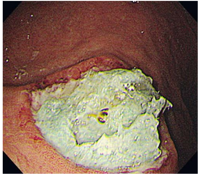
► Fig. 3 Endoscopic image of ESD ulcer 7 days after ESD. PGA sheet was recognized on the ESD ulcer.