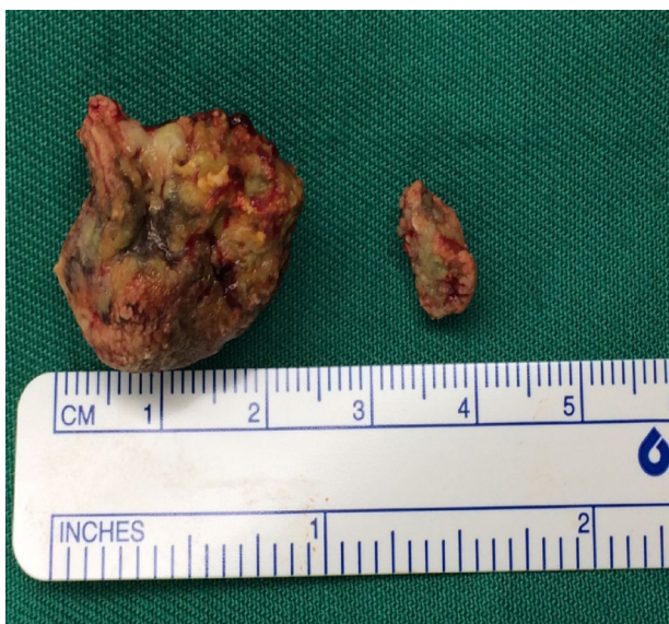
Figure 2 The larger round stone originated from the right peritonsillar space while the smaller oval stone was found at the upper pole of right tonsil.

under local anesthesia and histopathological examination (HPE) reported as inflamed granulation tissue. Full blood count, renal profile, liver function test were within normal range. Patient was then scheduled for examination under anesthesia, surgical excision and diagnostic tonsillectomy.