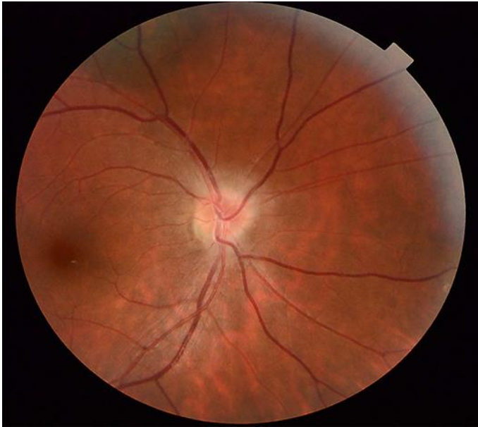
Fig. 1. Fundus examination of the right eye showed a swollen optic disc.