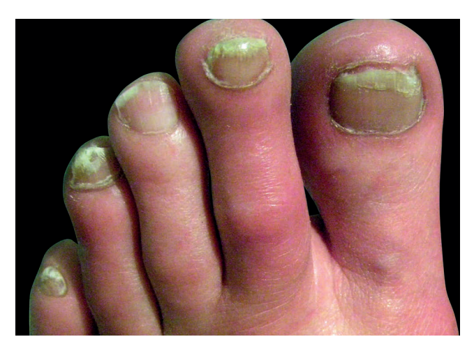
FIGURE 3: Combined erythema and edema due to foot erythromelalgia

ary infection followed by fissures, blisters, painful ulcers, cyanosis, gangrene or necrosis. Many patients know that burning pain is relieved with cold water or ice, an electric fan or staying in places with low temperature. Some of these methods lead to skin maceration followed by epidermis slough thus increasing the damage to the skin barrier. Cold could trigger long lasting vasoconstriction provoking ischemia and tissue necrosis, what could be interpreted by patients as aggravation of the disorder. Cutaneous dystrophies could increase pain and at the same time slow skin repair, deteriorating their quality of life and leading to social isolation, and in case of hypothermia adding a life-threatening risk. The patient must be advised to discontinue these practices. Some patients could develop skin automutilation behavior; although its mechanism is unknown, the poor quality of life could be related to this condition.<sup>218,32,34,36,62,66</sup>