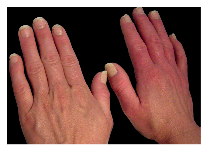
FIGURE 2: Erythema and edema on both hands, more pronounced on the right