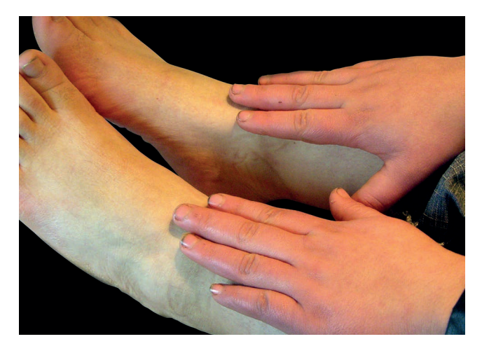
FIGURE 4: Acrocyanosis on both hands with slight livedo reticularis in the dorsal aspect. Feet are not compromised