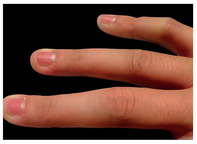
FIGURE 5: Red nails on hand