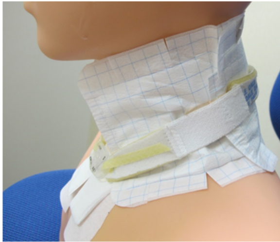
Fig. 2 Fixation of moderately absorbent surgical pad. All outpatients and their families are instructed on how to cover and moisten the irradiated area. The tape is not directly applied to dermatitis-affected areas. The pad provides moderate but not complete absorption of exudate and protection of the wound surface. The exterior surface of the pad prevents the passage of water and dirt from the outside, while the interior surface is a breathable waterproof film. The outside of the film is a high-visibility white-backed sheet

Common Terminology Criteria for Adverse Events (CTCAE) v4.0 occurring from the initiation of radiotherapy to 4 weeks after the end of radiotherapy. Grading of radiation dermatitis will be performed by central review using photographs [14] taken weekly by blinded trained physicians.