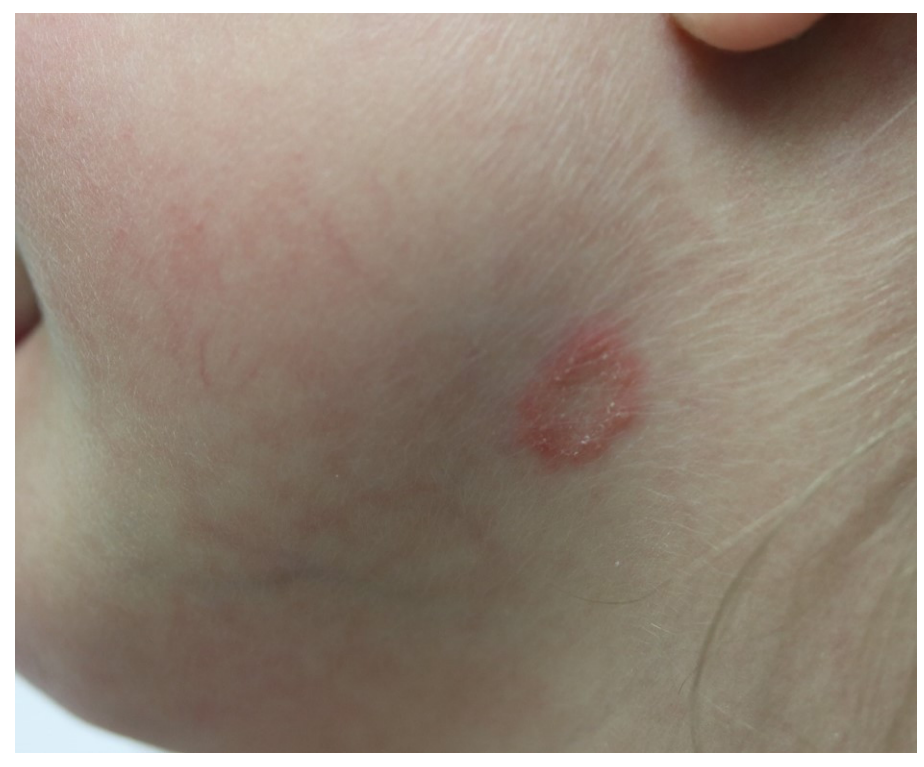
Figure 2: Manifestation of Trichophyton violaceum on the neck

retrospective; 3 studies were prospective or cross sectional [20], [33], [47], and 1 was a case report [16].