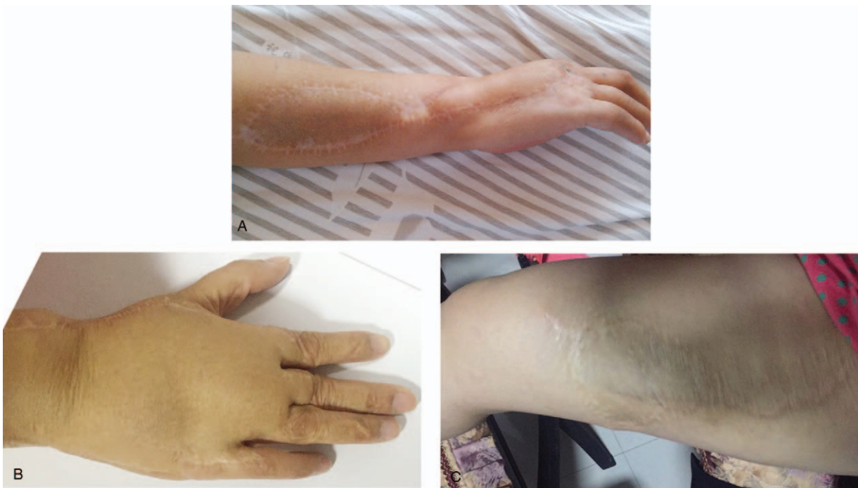
Figure 3. Aesthetic outcomes after reconstruction of soft tissue defects of the dorsal hand. (A) (upper) Result observed 13 months after the pedicled PIA flap transfer. (B) and (C) (lower) Results observed 38 months after the ALT flap transfer; during this period, patients underwent many revision surgical procedures (B: the recipient site of the free ALT flap; C: the donor site of the free ALT flap; and D: a full-thickness skin graft was performed at the donor site of the ALT flap). ALT=anterolateral thigh, PIA=posterior interosseous artery.

The difference in operative time between the PIA flap group and the ALT flap group was statistically significant (136 vs 229 min). The reason for this difference is that the ALT flap requires complex intramuscular dissection procedures and microvascular anastomoses techniques [2,3] compared with the pedicled PIA flap. In addition, the primary closure of the donor site of the flap was determined by the flap width. The maximal flap width required for primary closure was 10 cm in the ALT flap group [24] and 6 cm