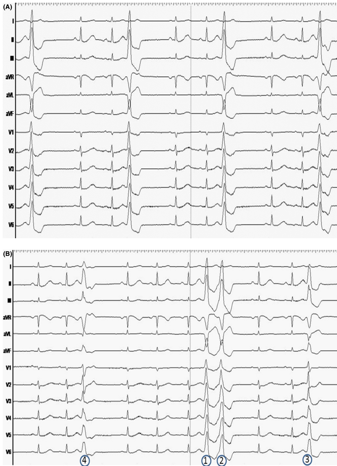
Figure 1. (Panel A) Dominant PVC with RBBB morphology and high amplitude R wave in DII and DIII ( 1.8 \pm 0.3 mV). (Panel B) PVC number 1 was the dominant one and was targeted for ablation. PVC number 2 was very similar to the clinical one but was slightly different (note the larger QRS width) and so needed to be rejected in the activation map. PVC number 3 and 4 were two additional PVCs that were observed in this patient.