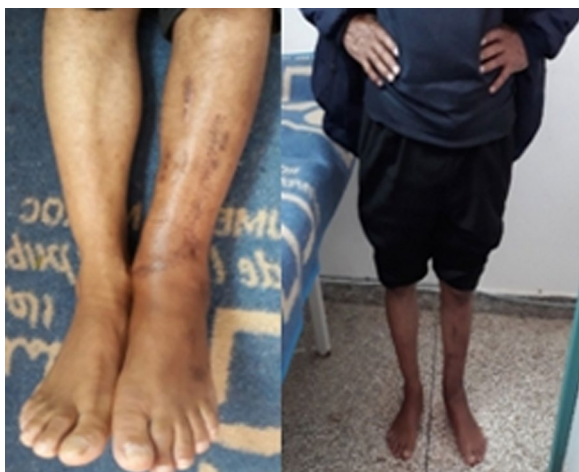
Fig. 2 Clinical result at 4 months

to violent trauma. The average age of our patients was 41 years (range 28–59 years) which matches the data of the series [12–16], and this age group corresponds to a period when there is a lot travel and professional activity. Road accidents are the main cause (88.4%) of initial fractures [17]; in our patients, this causal agent represents 85% of cases. In our series, the initial open fracture was found in 35 patients (87.5%) with a predominance of type III according to the Gustilo classification; we observed: 10 patients of type I, 4 patients of type II, 18 patients of type IIIA and 3 patients of type IIIB, which agrees with the data in the literature [14–16], and skin opening can be correlated with the decrease in bone healing power as well as the initial