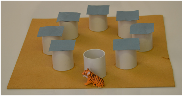
Figure 2. Apparatus used for the object search task.

gaze was directed on the tiger the researcher placed it in the appropriate cylinder and covered the cylinder with the cardboard. While doing this the researcher said to the infant "Look, in he goes, let's cover him up, night-night Mr. Tiger, night-night." The infant was then distracted for 30 s using the Thomas the Tank Engine toy, which could be pulled back and released to travel across the table to the infant. The infant was asked to catch Thomas and then send the train back across the table to the researcher. After 30 s the researcher said, "[Child's name], where's that little tiger who went for a sleep? Can you find him for me?" If the child failed to indicate a location selection after 20 s had passed the researcher repeated the question.