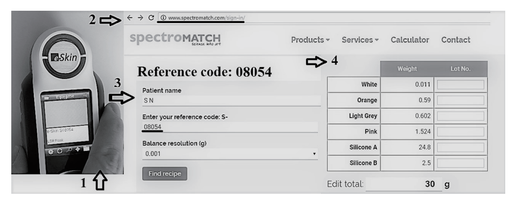
Fig. 2. Four steps of obtaining the recipe for a specimen (Specimen C25-1) using e-skin system (1) Measuring the specimen using spectrocolorometer and obtaining its color code (2) Finding E-skin system's on-line calculator (3) Entering the color code into calculator (4) Obtaining the recipe for a desired amount of silicone.

For assessing the agreement between L*, a*, and b* values of TC and RC silicone specimens, a two-way mixed average measures intraclass correlation coefficient (ICC) for consistency were calculated (confidence intervals set at 95%). For the L*, a*, and b*, the measured ICC was greater than 0.98, indicating excellent reliability between TC and RC silicone specimens (P < .001). In addition, ICC was also calculated for the TP values. Interpretation of ICC scores was based on Cicchetti's recommendations in which ICC of < 0.40 is poor, 0.40 - 0.59 is fair, 0.60 - 0.74 is good, and 0.75 - 1.00 is excellent.14