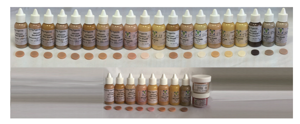
Fig. 1. The pigments used for 28 Target Colors and one specimen for each Target Color.