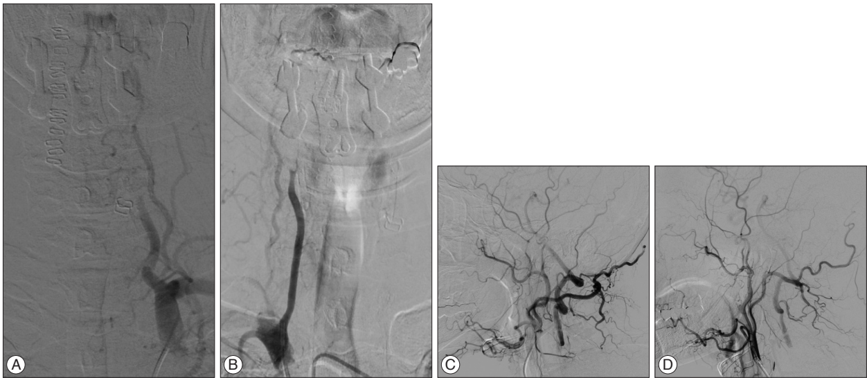
Fig. 5. Cerebral angiography on the 5th postoperative day showing complete occlusion of the bilateral vertebral artery, left (A) and right (B); collateral flows via the occipital arteries, left (C) and right (D).

to the non-dominant VA are not likely to be symptomatic 2 . However, unlike unilateral VA occlusion, in which only 20% of patients are symptomatic 4,24 , most patients with bilateral VA occlusion are symptomatic 24 . Bilateral or dominant VA occlusion may cause rapid and fatal ischemic damage to the cerebellum and brain stem 16 .