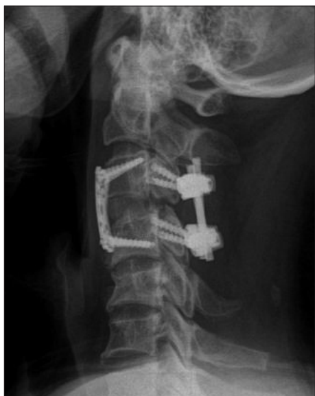
Fig. 2. Postoperative plain X-ray showing anterior and posterior fixation of the cervical spine at the C3–4 level in the lateral view.

angiography showed bilateral VA occlusion near the C3–4 level (Fig. 4). Cerebral angiography demonstrated complete occlusions of the bilateral VA and left PICA. However, collateral flows from the bilateral external carotid artery (ECA) via the occipital artery and ascending cervical artery were present (Fig. 5).