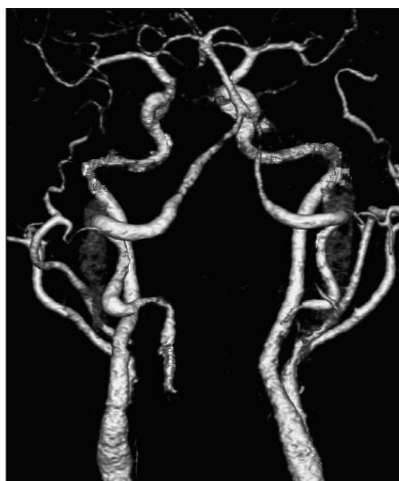
Fig. 4. CT angiography on the 5th postoperative day showing bilateral vertebral artery occlusion.