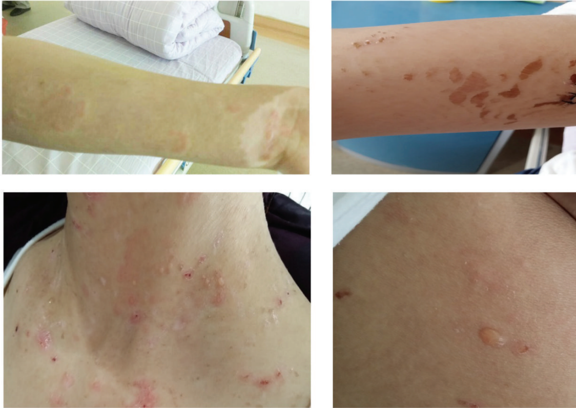
FIGURE 1: Gross view of the skin lesion. Presence of tense vesicles (marked with an arrow) filled with clear fluid on the arm, neck, and back.