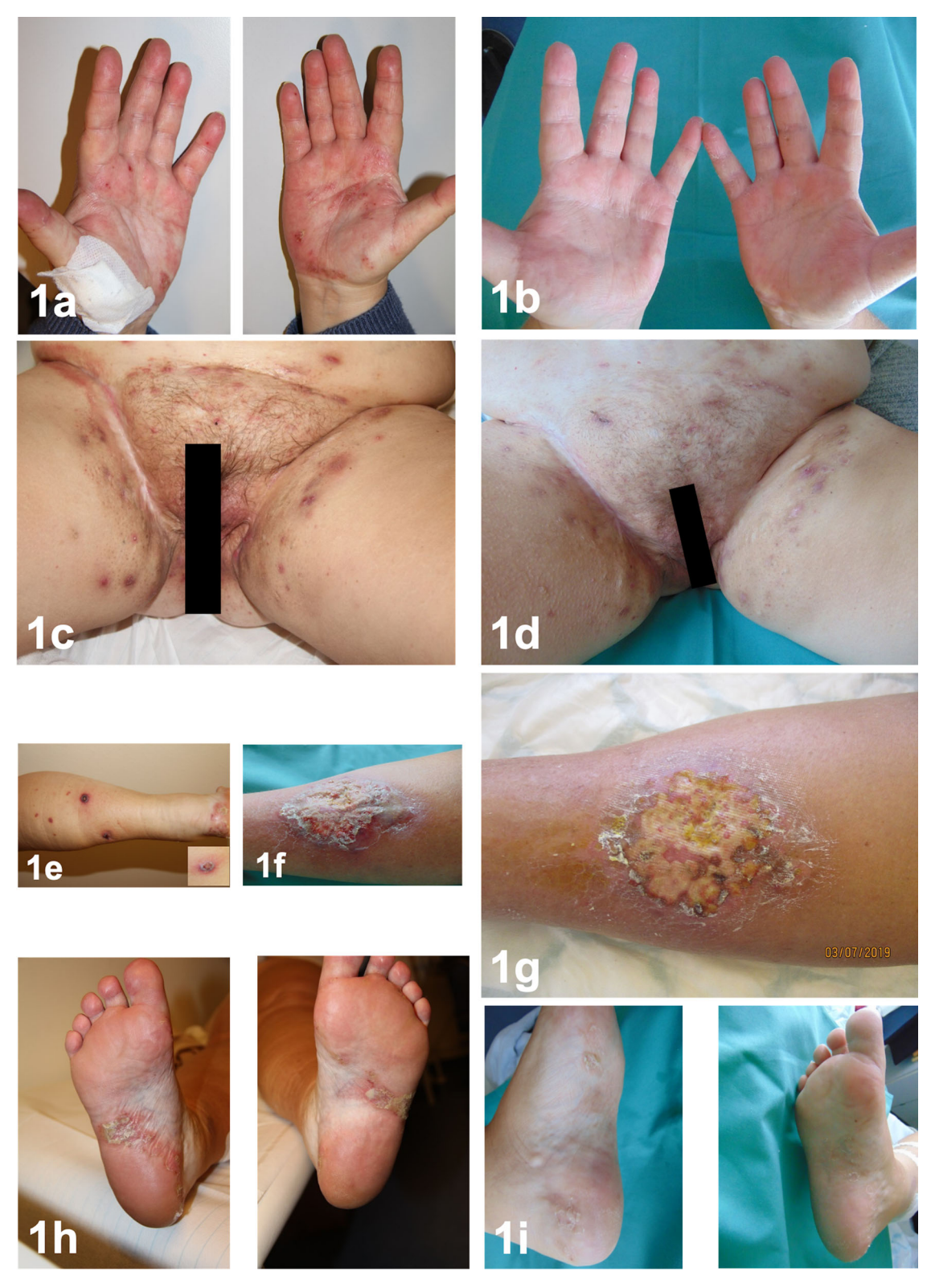
Figure 1. palmar psoriasis before (1a) and after (1b) treatment with secukinumab over 4 months. Manifestations of HS localized in the inguinofemoral region before (1c) and after (1d) treatment. Pyoderma gangrenosum two months after adalimumab discontinuation (1e), clinical image 4 months after secukinumab treatment (1f) and post-prednisolone i.v pulse therapy (1g). Plantar pustulosis before (1h) and after secukinumab treatment (1i).