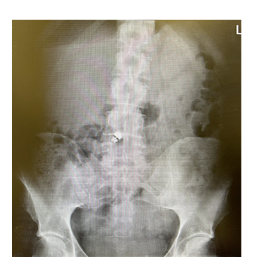
Fig. 3. Plain X-ray of the abdomen showing the presence of capsule in the lower abdomen.

Tayyub et al.: Diaphragm Disease – A Rare Cause of Small Bowel Strictures