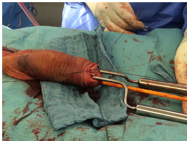
Figure 1 T-shunt operation with dilatation using 12-mm Brook's dilators.

A complete medical history of each case forms the cornerstone of priapism diagnosis. This helps to identify the underlying type of priapism. Ischemic priapism can be suspected if the patient has progressive penile pain that increases with the duration of the erection. This type of priapism is also suspected if the patient has used a known drug associated with priapism, if he has sickle cell disease or another blood dyscrasia, or if he has a known neurological condition. Stuttering priapism is usually associated with repeated episodes of prolonged erections and/or generally