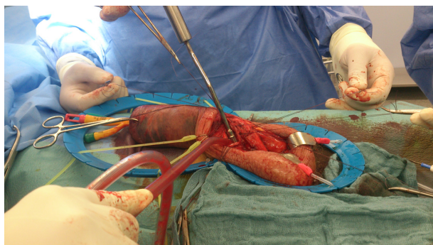
Figure 3 Penoscrotal approach for semi-rigid penile prosthesis with proximal dilatation using Rossello dilators.

Blood gas tests and color duplex ultrasound examinations are mostly reliable disease-identifying tools in priapism patients. In ischemic priapism, aspirated corporal blood is generally dark in color, PO_2 = 30 mmHg, PCO_2 = 60 mmHg, and pH = 7.25 . Color duplex ultrasound could be used as a further option for cavernosal blood gas sampling. 3 Penile and perineal color duplex ultrasound is recommended for evaluation of non-ischemic priapism, as it detects approximately 70% of these cases. In addition, it helps to distinguish