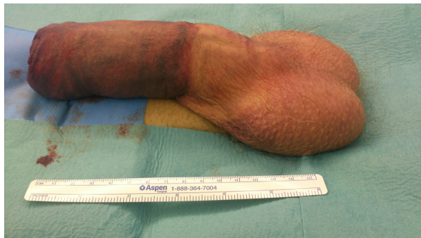
Figure 2 Edematous and erect penis after T-shunt operation.

unresolved morning erections. 7 Our patient had prolonged non-resolving morning erections with progressive penile pain increasing over time.