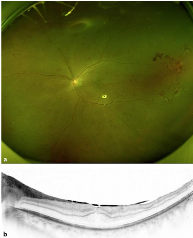
Fig. 2. Postoperative day 9 appearance. a Panoramic ophthalmoscope showed an apparently improved fundus. b Spectral domain optical coherence tomography revealed an irregular retinal surface with a silicone oil interface.